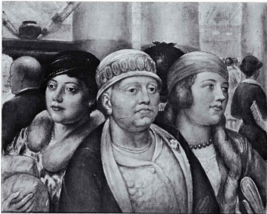
Kenneth Hayes Miller