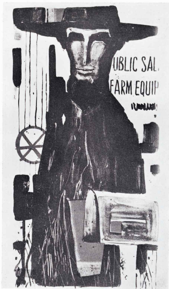
ROOTED AMERICAN Lithograph