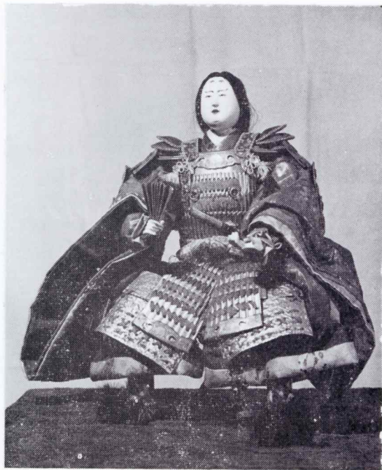
EMPRESS JINGO - DOLL