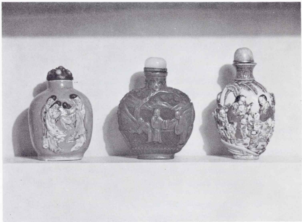
THREE SNUFF BOTTLES