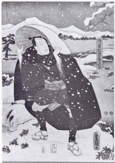
JAPANESE PEASANT PRINT Toyokoni, The Third No. 79