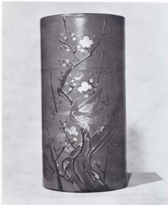
JAPANESE LACQUER TEA CADDY