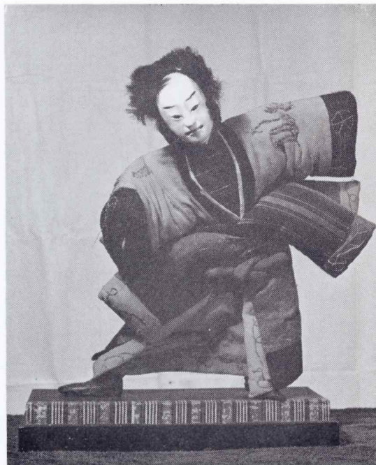
SAMBASO DANCER — DOLL No. 27