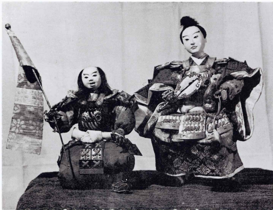
WARRIOR AND STANDARD BEARER – DOLL No. 23