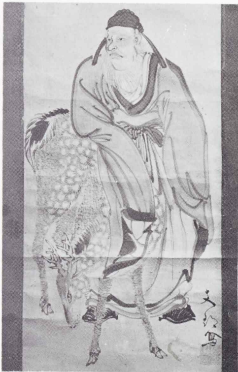
Sage and Deer — Scroll

On Exhibit at the STORM KING ART CENTER Old Pleasant Hill Road Mountainville, N. Y.