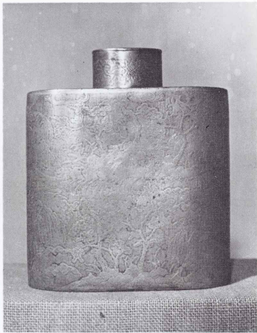
PEWTER TEA CADDY