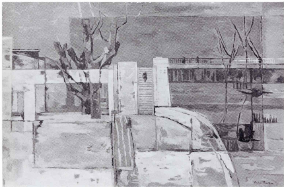
Bridge at Arles — Painting