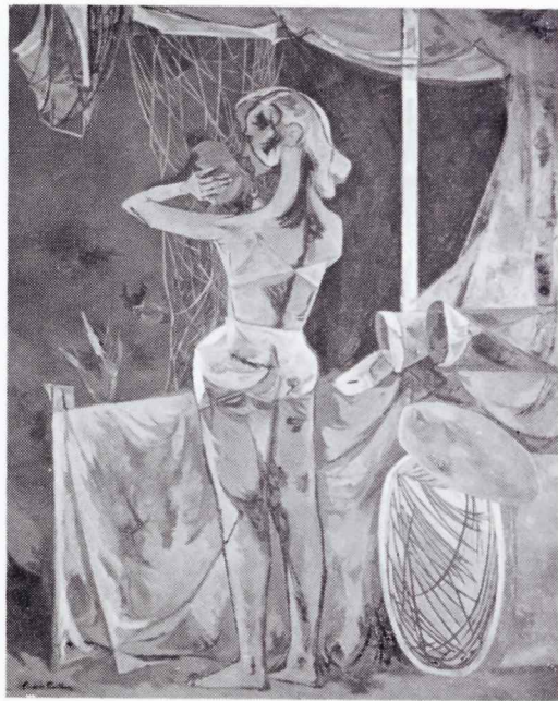
Entre-Acte — Painting