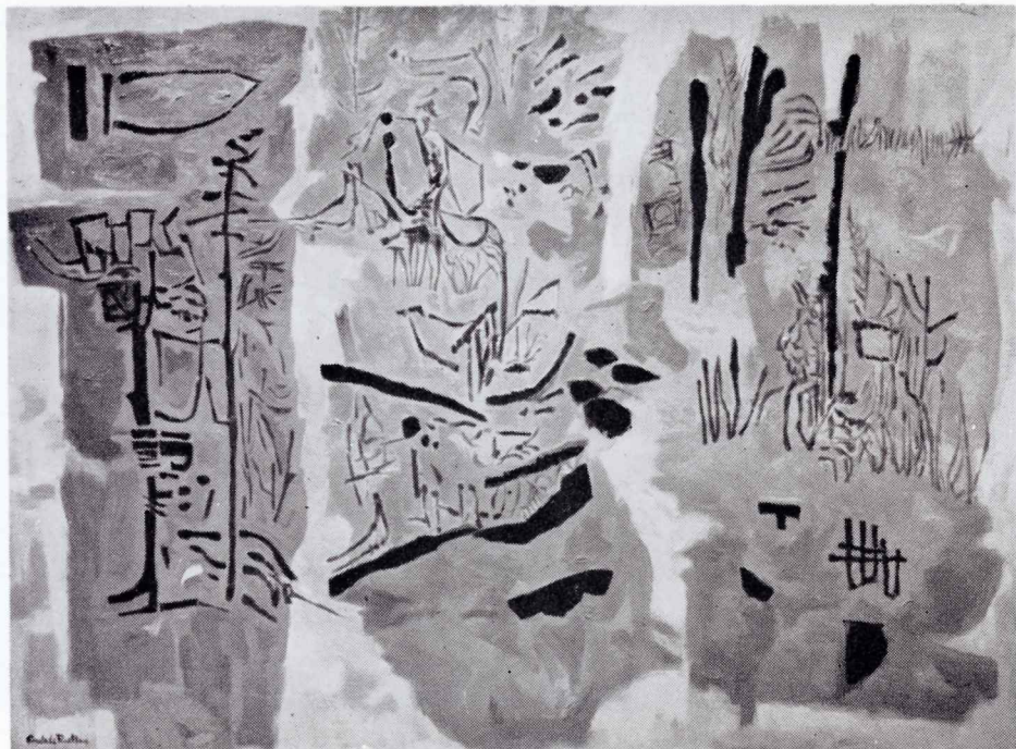
Lake Alice – Painting