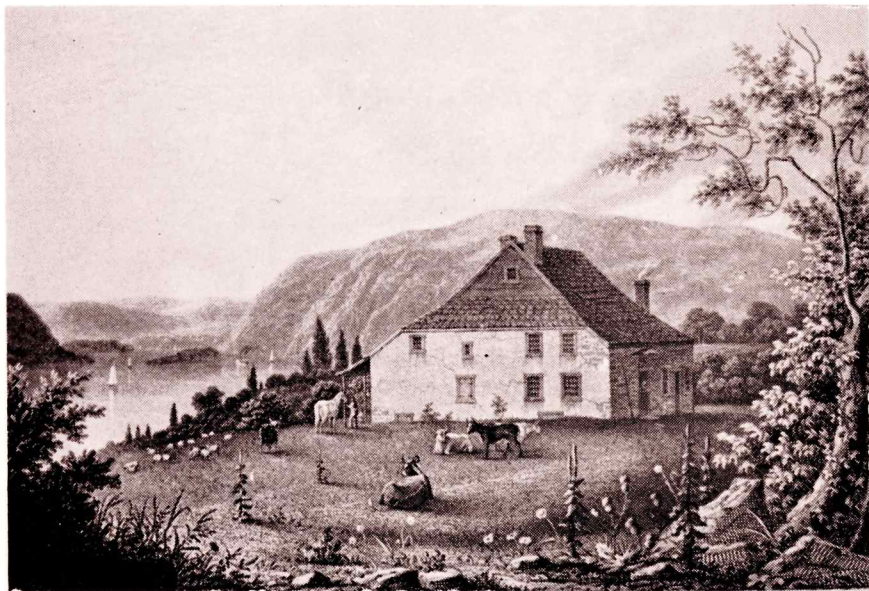
WASHINGTON'S HEADQUARTERS, NEWBURGH, N. Y.