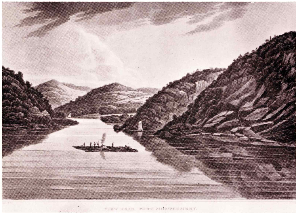
VIEW NEAR FORT MONTGOMERY.