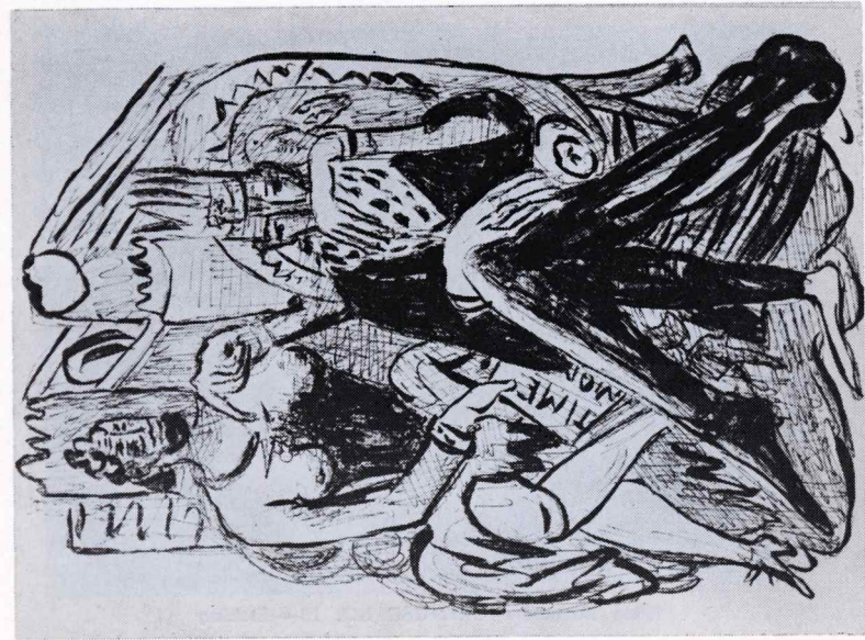
Beckmann — KING AND DEMAGOGUE — Drawing