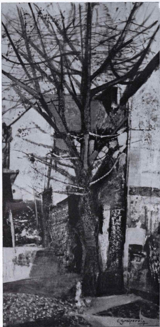
Grosperin — LE TILLEUL — Painting