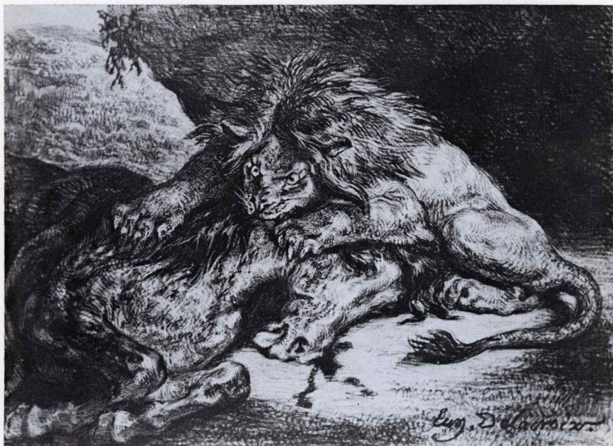
Delacroix — LION DEVOURING A HORSE — Lithograph