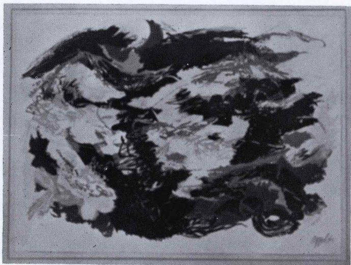
Karel Appel — DANSE LA TEMPETE — Lithograph