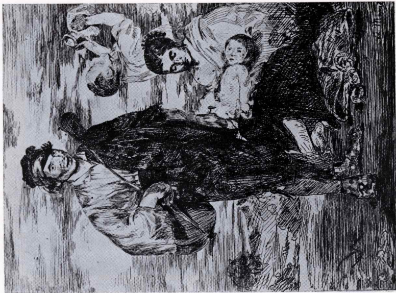
Manet — LES GITANOS — Etching