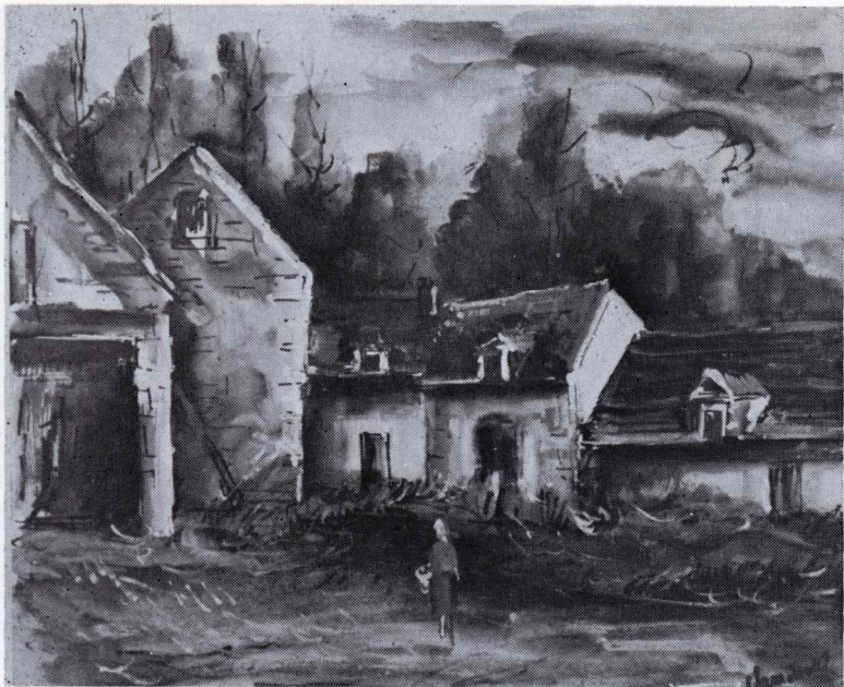
Vlaminck — LA FERME — Watercolor